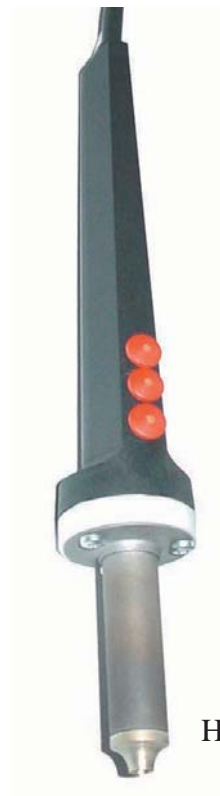
Hot Air Tool